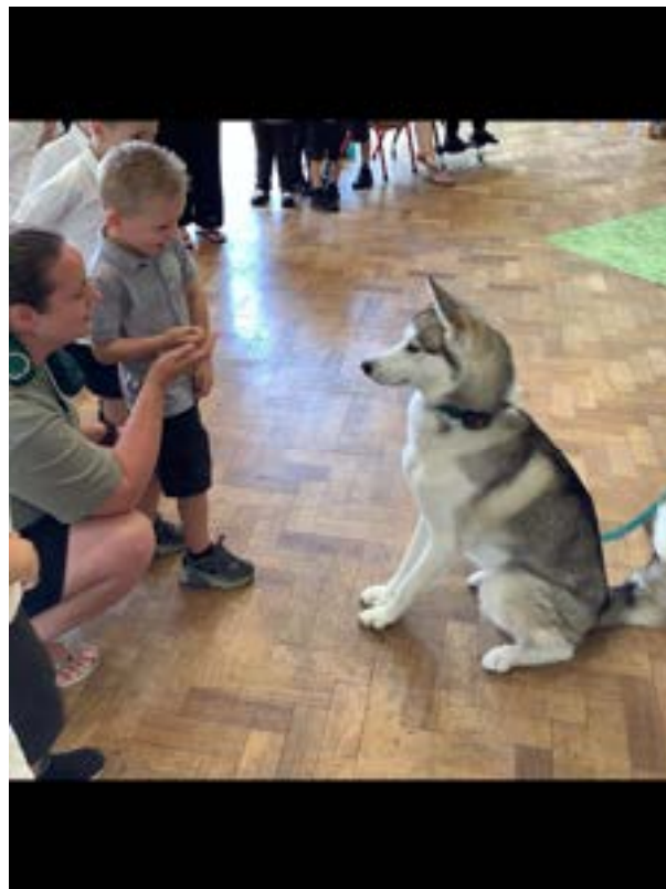
Year 1 & 2 Fathers Day Afternoon