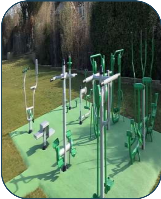
Provision of outdoor gym equipment