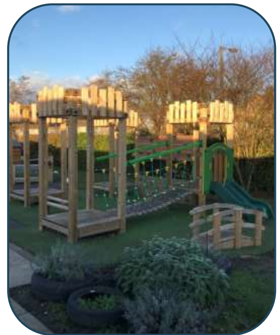
Replacing climbing frames in all playgrounds

Plus... The New outdoor classroom, New curtains for the main hall, outdoor educational posters, SEND resources, wet play toys, a defibrillator and repairs to pool facility!