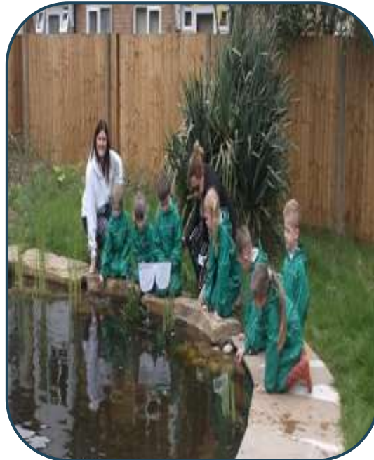
Clearing and landscaping the pond as an outdoor learning area